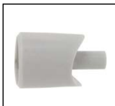
Stacking Buffers with peg to put on