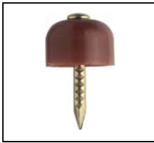
Shelf Supports with movable pin

Material: polystyrene Colour: white or brown