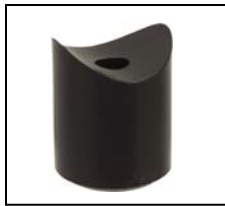
Stacking Buffers with continuous 5 mm drill hole, for screwing on