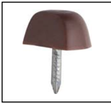
Shelf Supports with fixed pin

Material: polystyrene Colour: white or brown